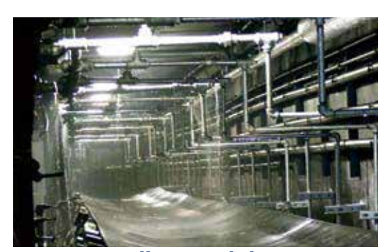
Conveyor gallery Washdown System