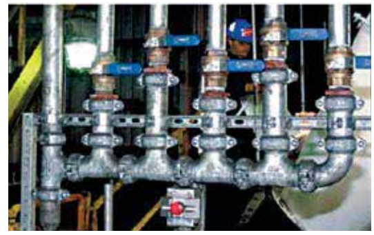
Custom control stations