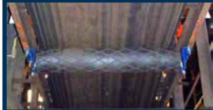
Adjustable tensioning brackets assure proper tension for maximum belt tracking performance