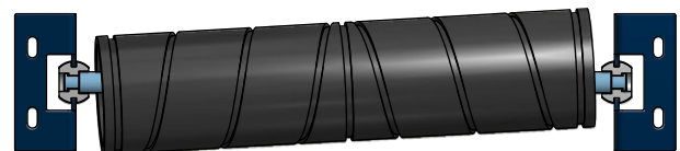
Below: Aerial view of Benetech Training Idler adjustment motion.

The Benetech Training Idler accommodates belts ranging from 450-2300mm.