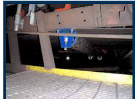
Benetech Training Idler in action preventing belt damage

The Reversible Benetech Training Idler is available if required for reversing conveyor belts.